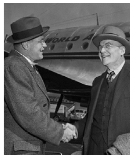
The Dulles brothers, Allen on the left (1948).

Unlike Truman, who infrequently attended NSC meetings, Eisenhower considered the group to be the backbone of his foreign and military decisionmaking team. Here, the DCI covered broad subjects of interest to the president cleared in advance with the NSC secretary and the president’s special assistant for national security affairs. While Dulles was himself well-informed about political issues, he tended to defer to Agency subject-matter experts on scientific and military topics outside his normal purview.