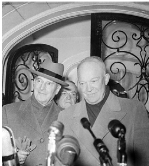
Ike meets the press after his meeting on 17 December 1952 with Douglas MacArthur. Secretary of State Dulles looks on.

The president-elect acted quickly on his campaign pledge to go to Korea, reaching Seoul on 2 December. During the next two weeks, he met with military commanders, Generals